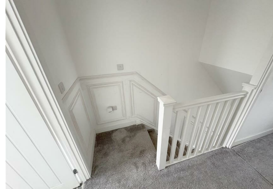
Bedroom two 13'5" x 8'7" (4.09m x 2.62m)